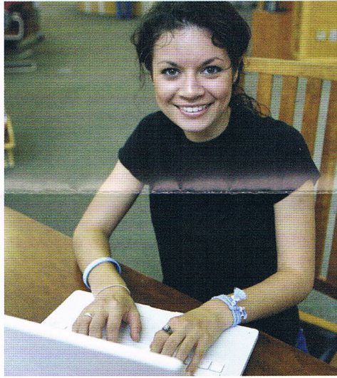
"Google it" they often say

The shocking truth is if you are not on the first page of the Google results, you are nowhere. Most people don't bother looking past the first page. In fact most don't bother looking past the first five search results. Do you?